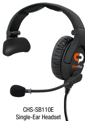
CHS-SB110E Single-Ear Headset